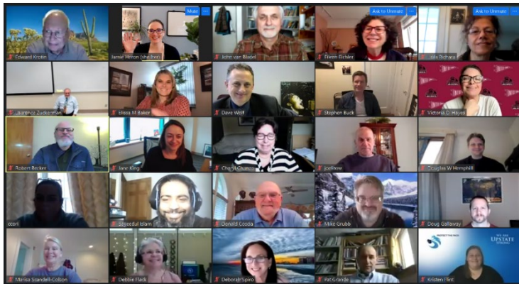
Some Fireside Chat Attendees Before the S'mores were served!